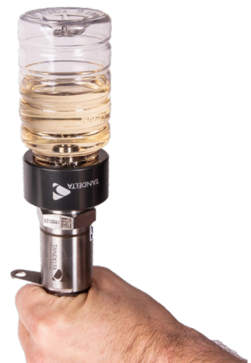
Accurate instant oil analysis of any oil type.